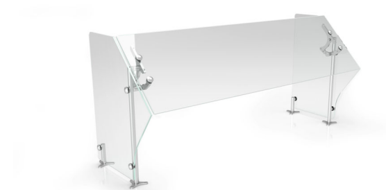
ADJUSTABLE/CONVERTIBLE FOOD PROTECTORS