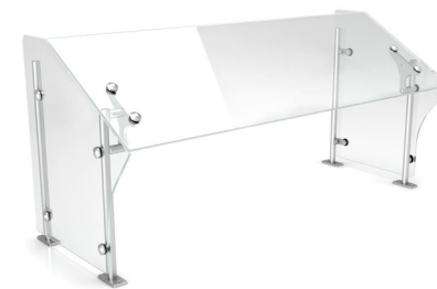
SELF-SERVICE FOOD PROTECTORS