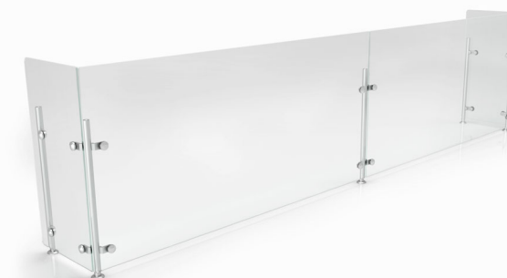
VERTICAL FOOD PROTECTORS