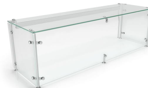
FULL SERVICE FOOD PROTECTORS