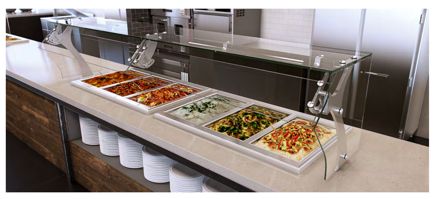
VGE3-SK-E ADJUSTABLE SELF-SERVICE FOOD PROTECTOR WITH TOP SHELF