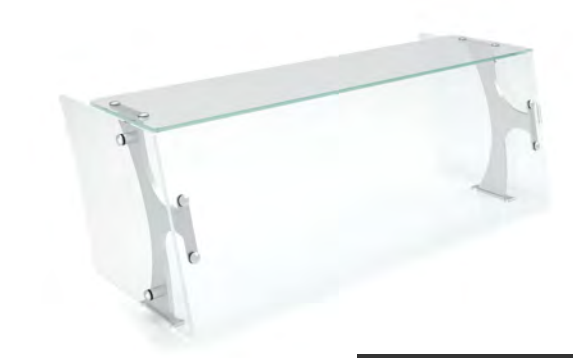
FULL SERVICE FOOD PROTECTORS